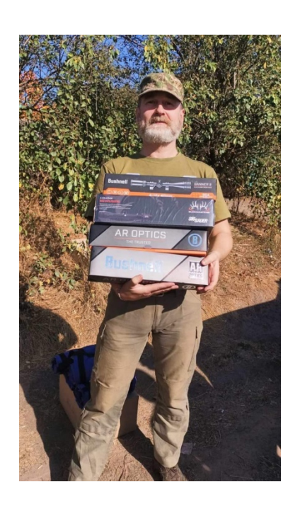
Optical scopes have gotten guys from "Stormy" guardian battalion.