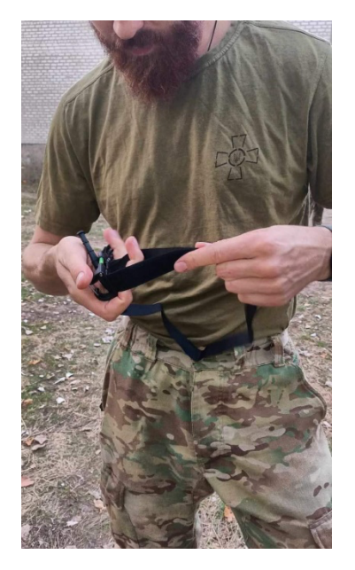
They really liked the torniquets

Below you will see more photographs from Ukraine about receiving Aid from Alaska.