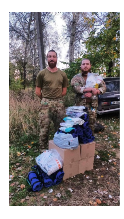
The medics from "Azov" thanked very much! They are from a tank company.